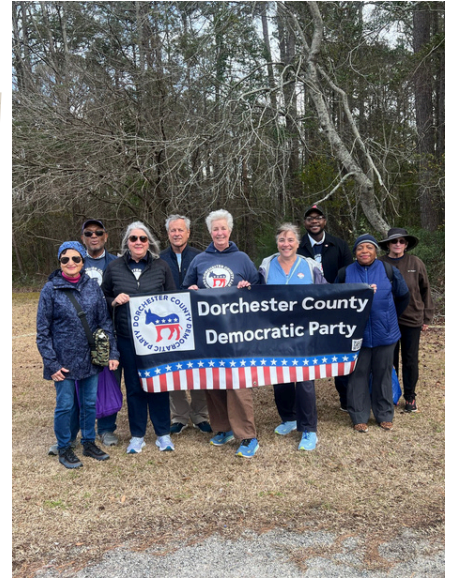
Annual MLK Parade

THE DORCHESTER COUNTY DEMOCRATIC PARTY PRESENTS