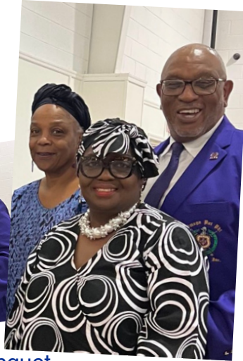
NAACP MLK Banquet with Representative Jim Clyburn